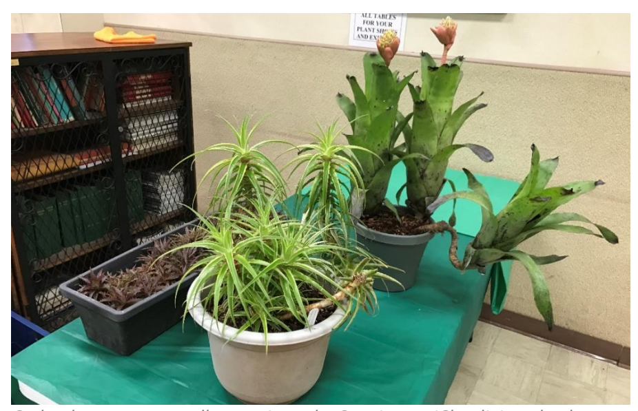
Orthophytum vagans albomarginated, xQuesistrum 'Claudia', and unknown Dyckia "seedling swarm". September auction plants.

The raffle table by Dave Kennedy was incredible. So many spotless collector's plants! He also brought a full table of extra-special broms for sale and donated 3 impressive specimens for the club auction.