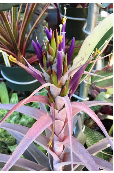
Tillandsia 'El Rancho' in bloom at Scott's

October Bus Trip: I'll be happy if we have a near-capacity bus on our October nursery trip on Saturday, October 28 to Rainforest Flora and LiveArt Plantscapes. If you would like to go with us, please sign-up and pay at this month's meeting or have your check in Eloise's hands by October 21st. More information can be found on our website.