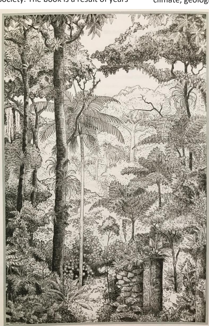
One of the book's illustrations, by the author, depicting the forest near Parati, Rio de Janeiro