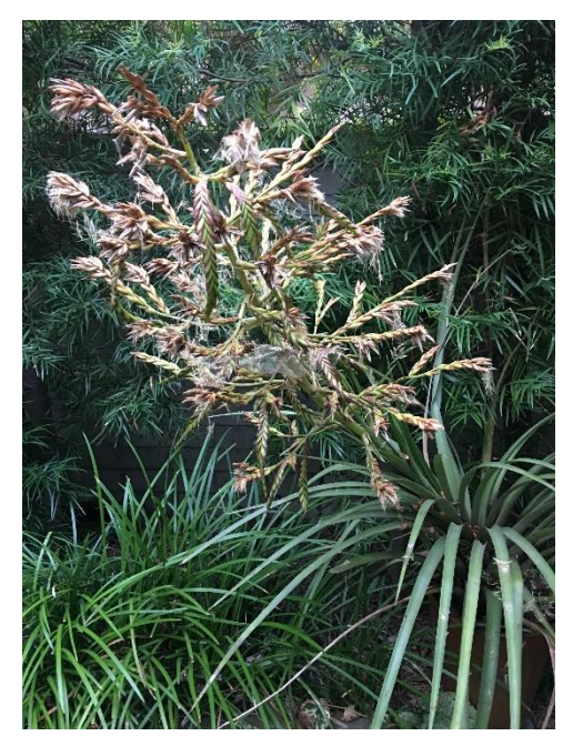
Tillandsia extensa – dehiscing!

Happy Autumn: It is a time of seasonal changes. Maybe it's the changing weather that has me reflecting on how differently bromeliads in my collection respond this time of year. Most of my mature Neoregelias have finished blooming, but a few stragglers are flowering now. Those that bloomed have small offsets growing. Having Neoregelias is rewarding in that the life cycle of the fast-growing ones can be just 2-3 years. On the other hand, it takes patience to grow other genera that take 10+ years before flowering. This year, a Tillandsia extensa that I've had for over 10 years finally went to seed. It is a strange plant; its flowers opened on the large inflorescence slowly over 13 months. It was a regular stop on the local hummingbirds' search for nectar. It produced its last few purple-blue flowers in September when seed capsules were dehiscing (popping open and releasing seed).