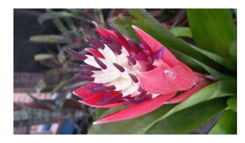
Billbergia 'Evelyn Metz'

Neo. 'Pepper' Neoglaziovia variegata Sincoraea rafaelii Til. heteromorpha Til. 'Redy' Til. Streptocarpa Vr. 'Gwydonia' (Red Chestnut x platynema) X flammea Vr. Rafaelii Werauhia sanguinolenta rubra (Panama) xEnchotia 'Ruby' xVriecantarea Julietta